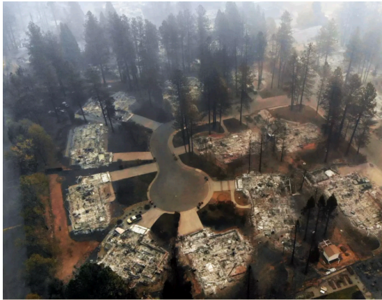
The Camp fire tore through Paradise, Calif.