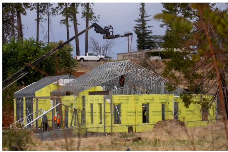
Five years after the Camp Fire, construction of steel frame homes are among the precautions the town is taking to prevent future devastation. Unlike wood, steel does not ignite, so can better withstand fire.