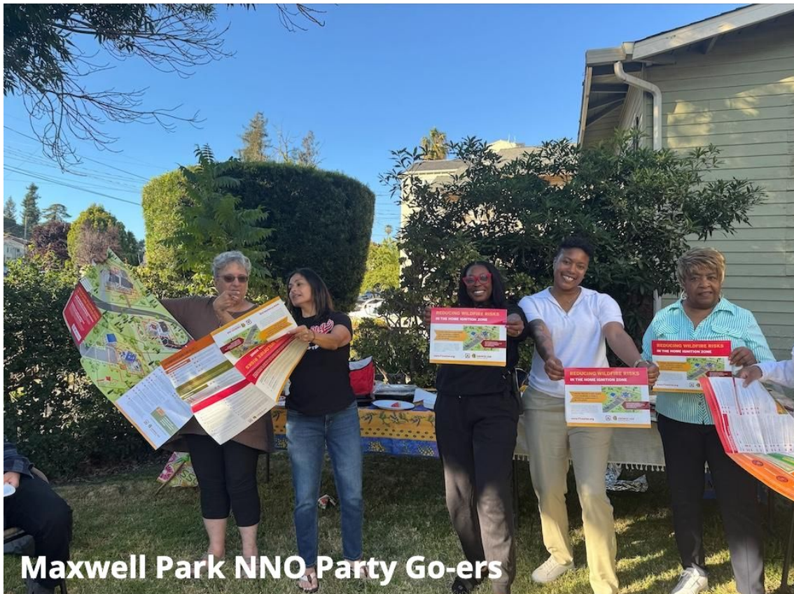
Maxwell Park NNO Party Go-ers