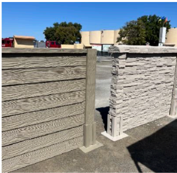
Pattern formed concrete

To learn more about best practices, get ideas for fire-smart fence and gate design, and see an extensive gallery of examples selected by Sheryl, watch the recording and see the PDF of her slides.