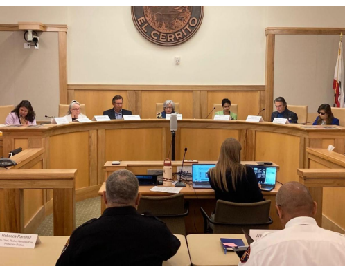
Cerrito City Hall." Photo: The East Bay Wildfire Council holds its July 8th meeting at El Cerrito City Hall

"I am proud to be serving as Vice-Chair of the East Bay Wildfire Council (EBWC), a regional body consisting of elected officials and fire prevention personnel aimed at preventing wildfires throughout the East Bay hills and surrounding communities. This effort spans across both Alameda and Contra Costa counties in multiple municipalities - including Oakland - and special districts. The next EBWC meeting will take place on Monday, September 23rd from 10:00am - 12:00pm at El