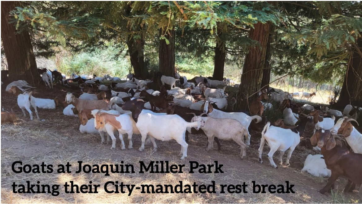
Goats at Joaquin Miller Park taking their City-mandated rest break