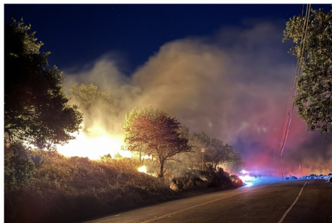
A vegetation fire in the Berkeley-Oakland hills on Monday, July 1, 2024.

Oakland Fire Dept was also out patrolling and responding well into the evening hours – thank you OFD!