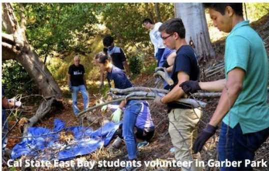
Cal State East Bay students volunteer in Garber Park