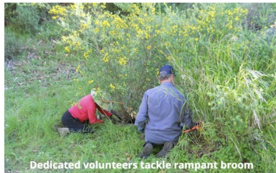
Dedicated volunteers tackle rampant broom

While numerous volunteer work days occur throughout the year at various Oakland parks, Earth Day presents an opportune time to get out and help decrease fire fuel loads. If you're interested in volunteering to cut, dig, wrangle and haul, visit our Park Stewards page for a list of locations, event calendars and work day info. NOTE: Actual Earth Day is Monday, 4/22, but many projects are scheduled for Saturday, 4/20.