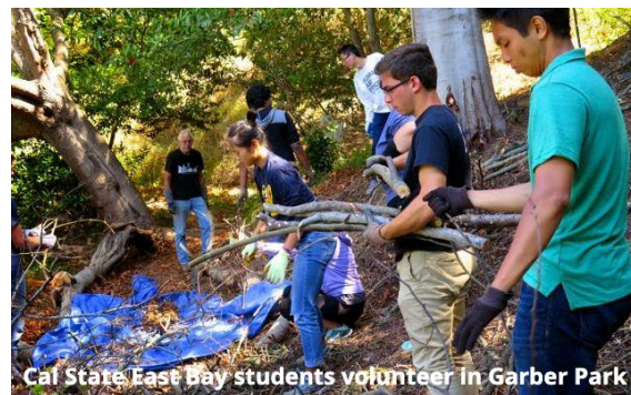
Cal State East Bay students volunteer in Garber Park

If you're interested in volunteering to cut, dig, wrangle and haul, review our Park Stewards page for park listings which can include their contact person and links to any available event calendars and work day info. NOTE: Actual Earth Day is Tuesday, 4/22, but many projects are scheduled for Saturday, 4/19.