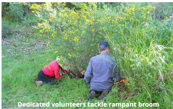
Dedicated volunteers tackle rampant broom

While numerous volunteer work days occur throughout the year at various Oakland parks, Earth Day presents an opportune time to get out and help decrease fire fuel loads.