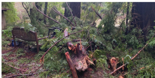
Fallen branches of a coast redwood ( Sequoia sempervirens ) after stormy weather in January 2024; Image: Ann-Marie Benz

Now that we've gotten past most of our winter storms, now is a good time to focus on tree care throughout year.