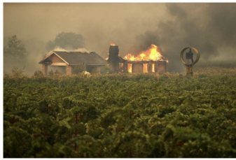
A house burns near a road after the Knolls Fire burned through the area on October 26, 2019 in Sonoma County, California. Forced by high winds, the Knolls Fire has burned over 10,000 acres in a matter of hours and has prompted evacuations in the Geyserville area.