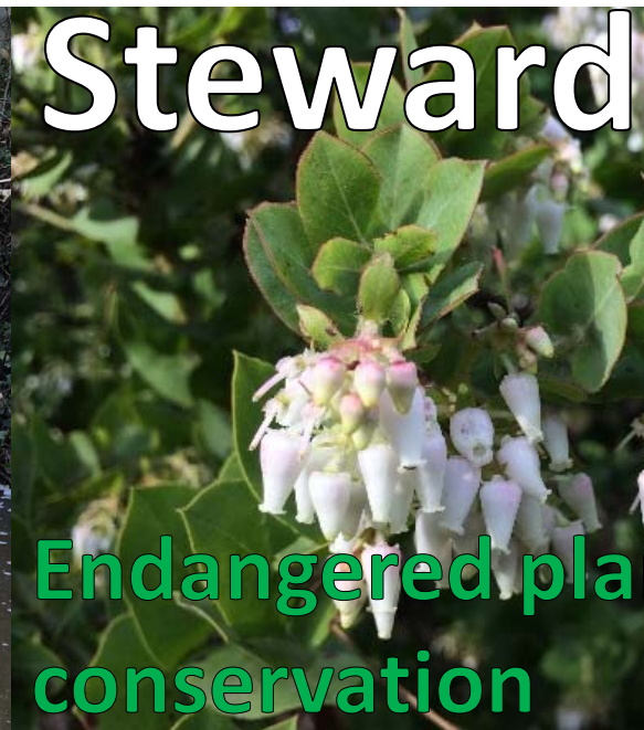
Endangered plant conservation