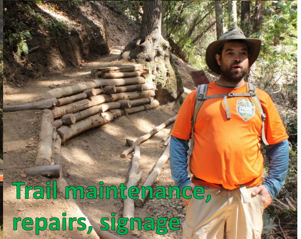
Trail maintenance, repairs, signage