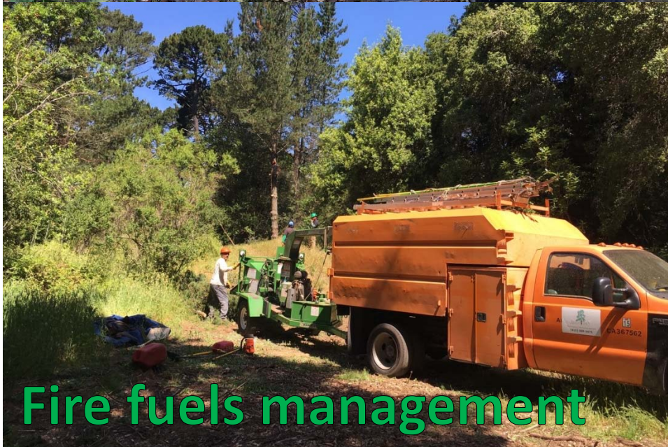
Fire fuels management